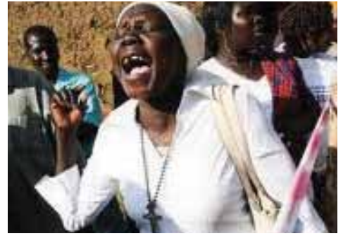
A Sudanese rejoices with her freedom to vote.

Independence came through a referendum when the South Sudanese were allowed to vote and decide who would rule them, but that opportunity was bought with huge human sacrifice. Many men, women and innocent children were killed for not