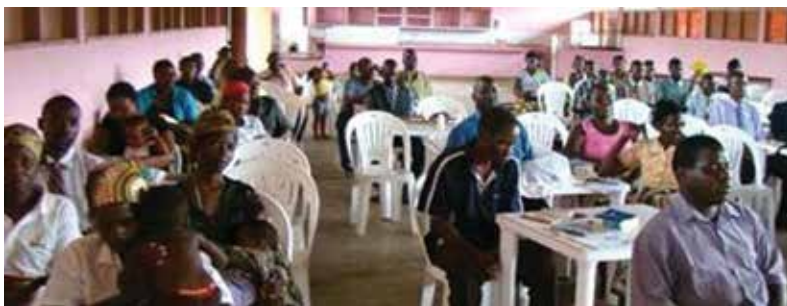
Portuguese-speaking Christians in Mozambique