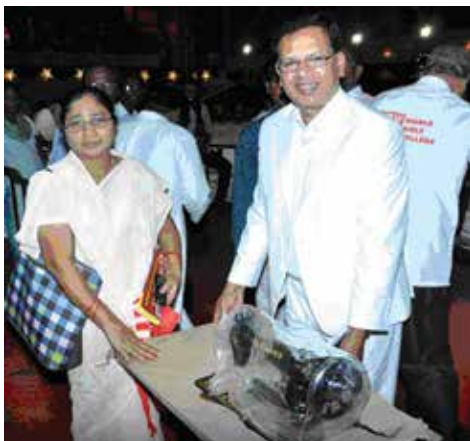
The gift of a sewing machine can make a life-changing difference.

Over 1,000 poor patients received free check-ups and medicines. They now believe we are interested in their long life and eternal life. The two villages where we drilled two water wells now have access to clean water and to the message of the Water of Life. The kids at the orphanage in Nagari are so happy for the refrigerator donated to them.