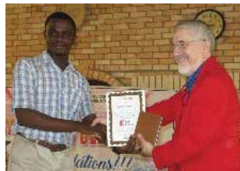
A proud graduate of PREP

Now, we need teachers and congregations to teach these students. Currently, we have over 1,700 students waiting for teachers! Wow, what a wonderful opportunity... especially as the benefits of Ghana PREP are still alive and well: