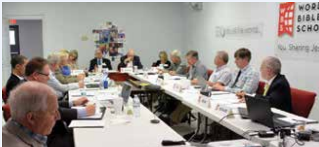
WBS leaders meet.

The Bible: World Bible School Study Edition is already a phenomenon. Since we first publicized this ESV Bible in January 2017, over 100,000 have been printed, and strong demand continues. Through the Incentive Bible program, WBS gives Bibles to proven seekers. Even with over a million current students, we plan—by faith—to fulfill the Incentive promise to as many as qualify (page 6). But why restrict the vision to horizons we can see? God leads us—He has no such limits. In recent strategy meetings, WBS leadership is exploring even greater dreams. Please be praying and dreaming with us. With God, all things are possible!