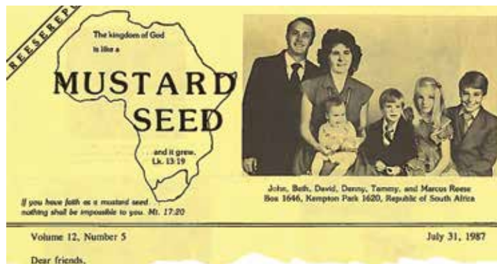
An issue of the Reese family “relationship” newsletter from 1987

F or many congregations, it is budget-preparation season—time to reconsider your missions effectiveness. Does your overall budget reflect Jesus' priority as stated in the Great Commission? Are your members sharing the saving Message? Are you partnering for maximum impact?